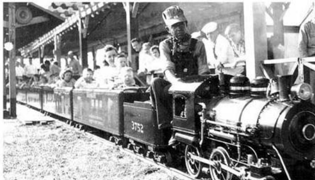
Ottaway Locomotive in operation 1950's